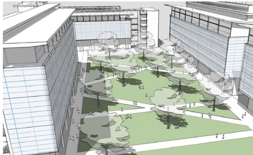
Quad framed by buildings on three sides