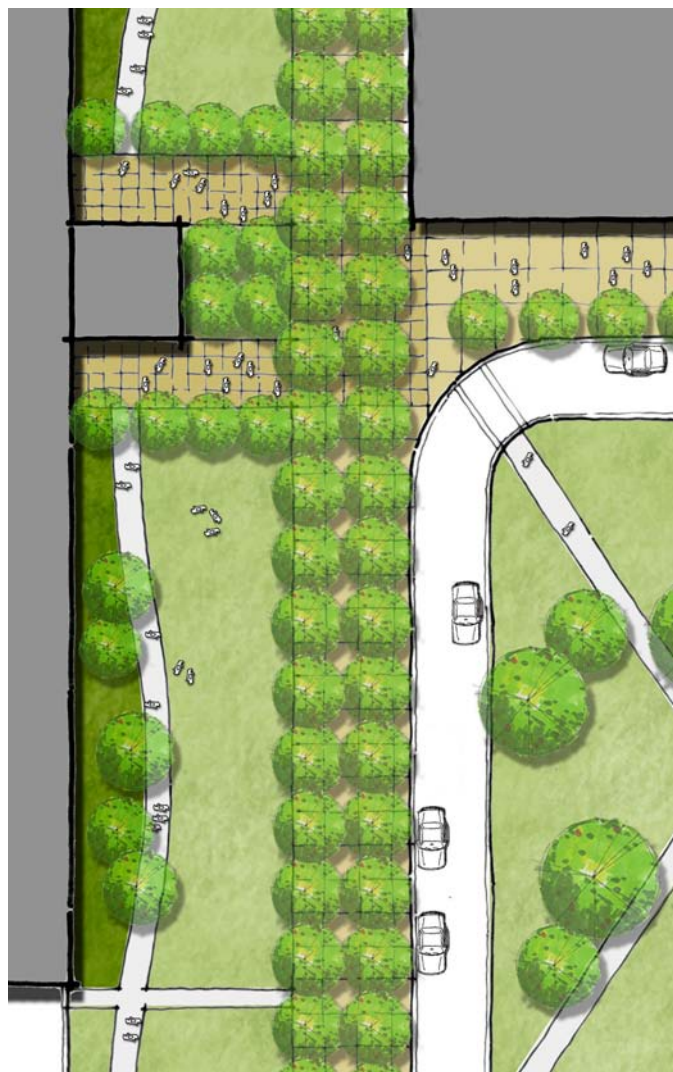
Proposed Promenade at Engineering Center Campus