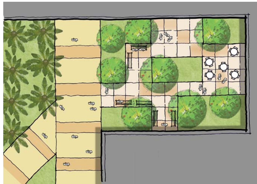
Proposed courtyard at Modesto A. Maidique Campus (Deuxieme Maison Building)