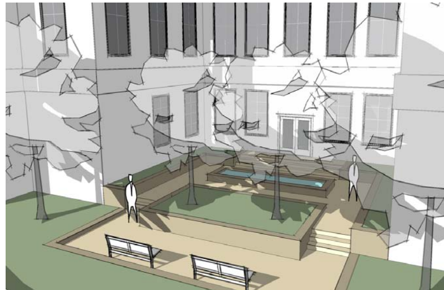
Courtyards can be secluded spaces for relaxation or opportunities for small gatherings