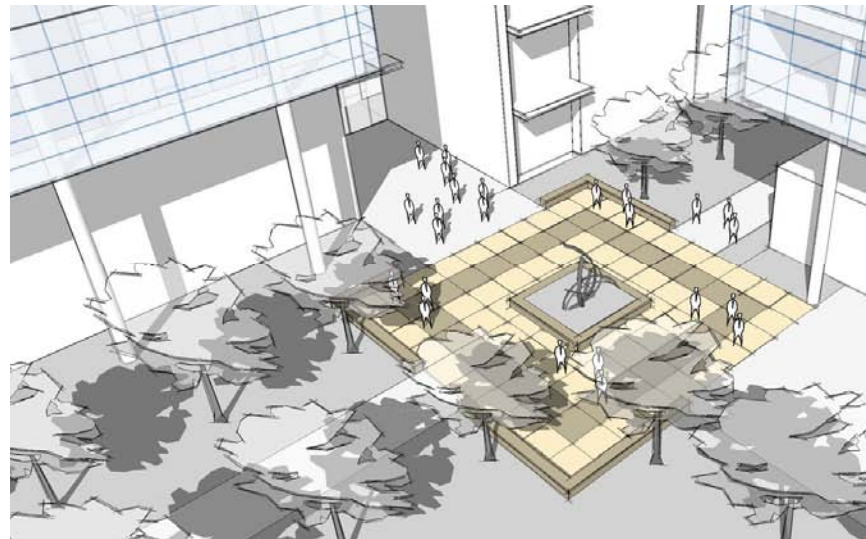
Plazas are special gathering spaces often characterized with unique hardscape materials and focal points