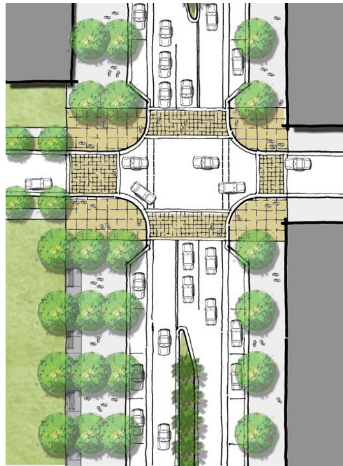
Plan of Proposed Main Street at Modesto A. Maidique Campus