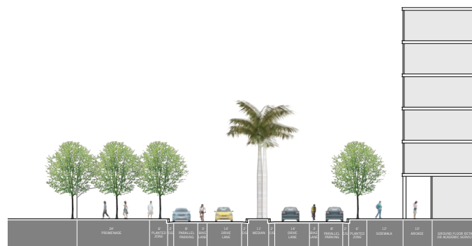
Section of Proposed Main Street at Modesto A. Maidique Campus